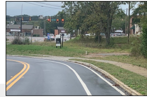
Hardin Street (view West)