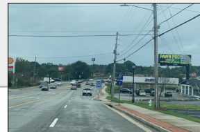
West Avenue (south to I-20)